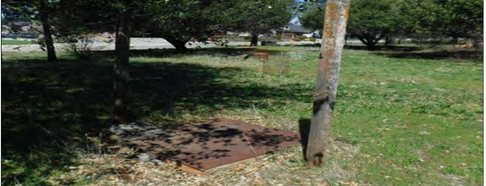
SITE PHOTOGRAPHS – APRIL 8, 2020 NOBLE PARK PROJECT EAST OF PENTZ ROAD AND SOUTH OF MERRILL ROAD, PARADISE, CA