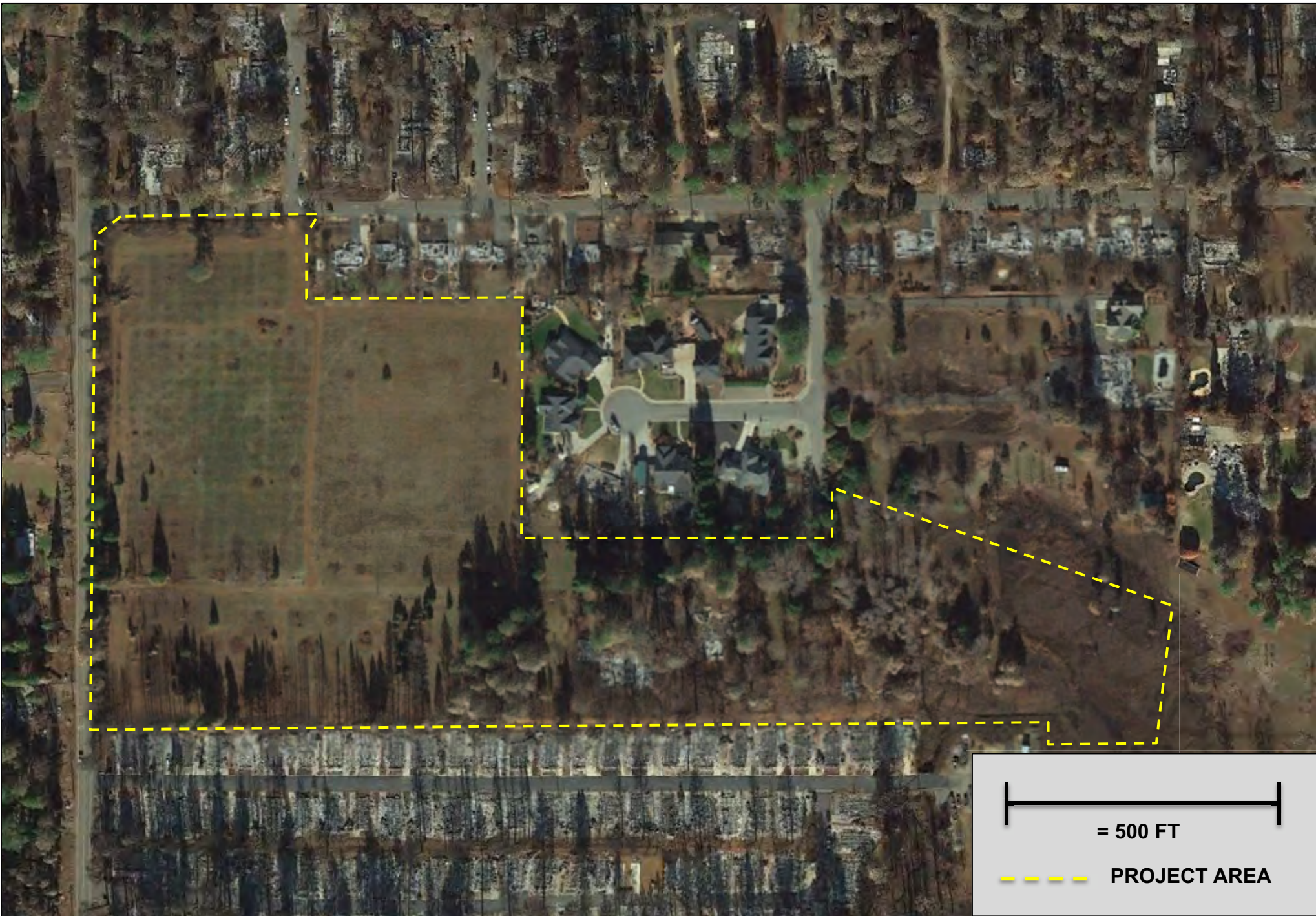
FIGURE 1: PROJECT AREA – CURRENT SITE CONDITIONS NOBLE PARK PROJECT EAST OF PENTZ ROAD AND SOUTH OF MERRILL ROAD, PARADISE, CA