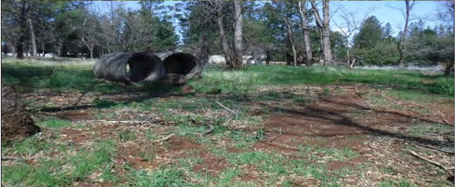
SITE PHOTOGRAPHS – APRIL 8, 2020 NOBLE PARK PROJECT EAST OF PENTZ ROAD AND SOUTH OF MERRILL ROAD, PARADISE, CA