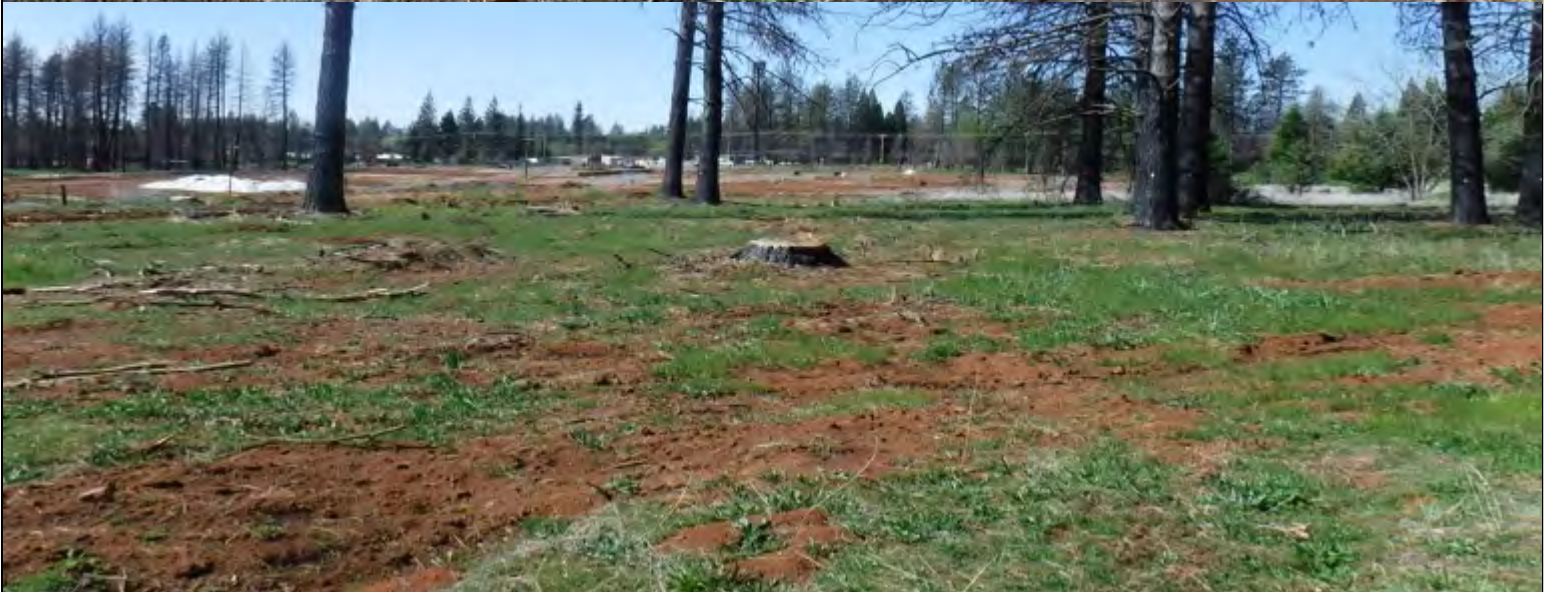
SITE PHOTOGRAPHS – APRIL 8, 2020 NOBLE PARK PROJECT EAST OF PENTZ ROAD AND SOUTH OF MERRILL ROAD, PARADISE, CA