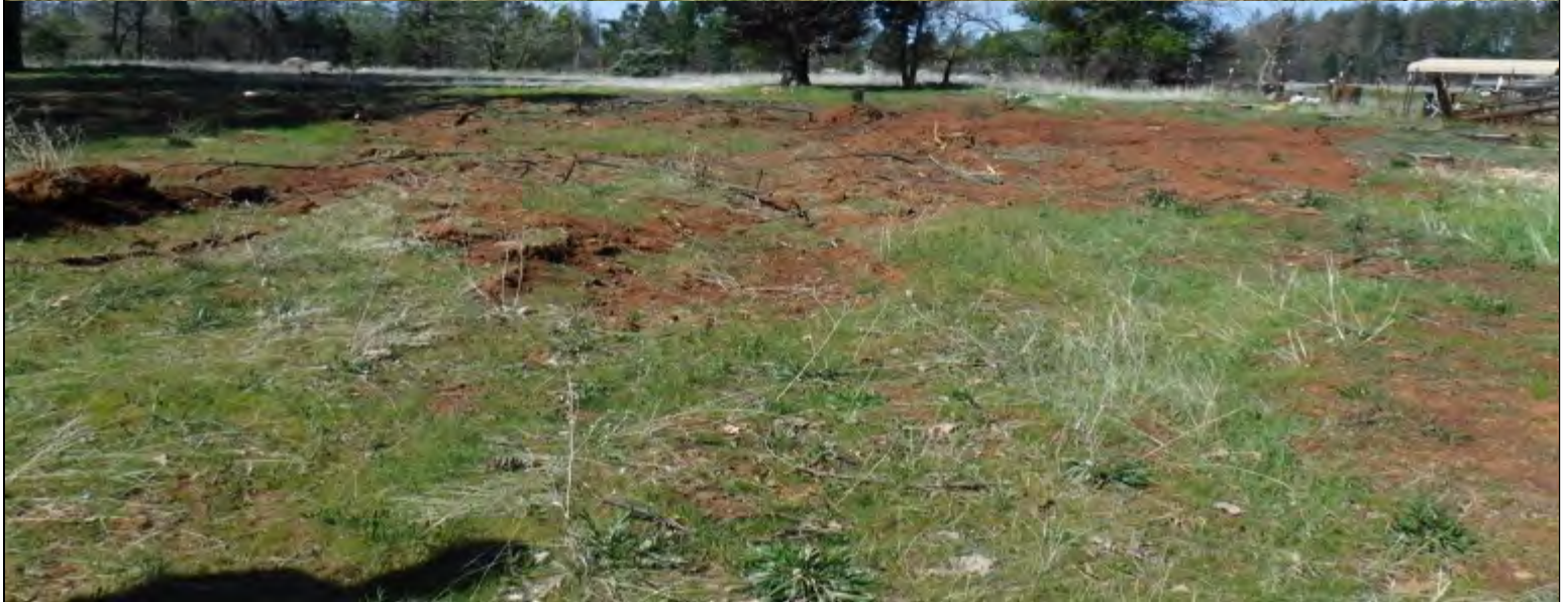
SITE PHOTOGRAPHS – APRIL 8, 2020 NOBLE PARK PROJECT EAST OF PENTZ ROAD AND SOUTH OF MERRILL ROAD, PARADISE, CA