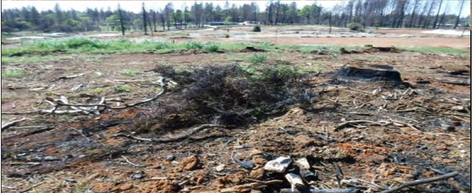
SITE PHOTOGRAPHS – APRIL 8, 2020 NOBLE PARK PROJECT EAST OF PENTZ ROAD AND SOUTH OF MERRILL ROAD, PARADISE, CA