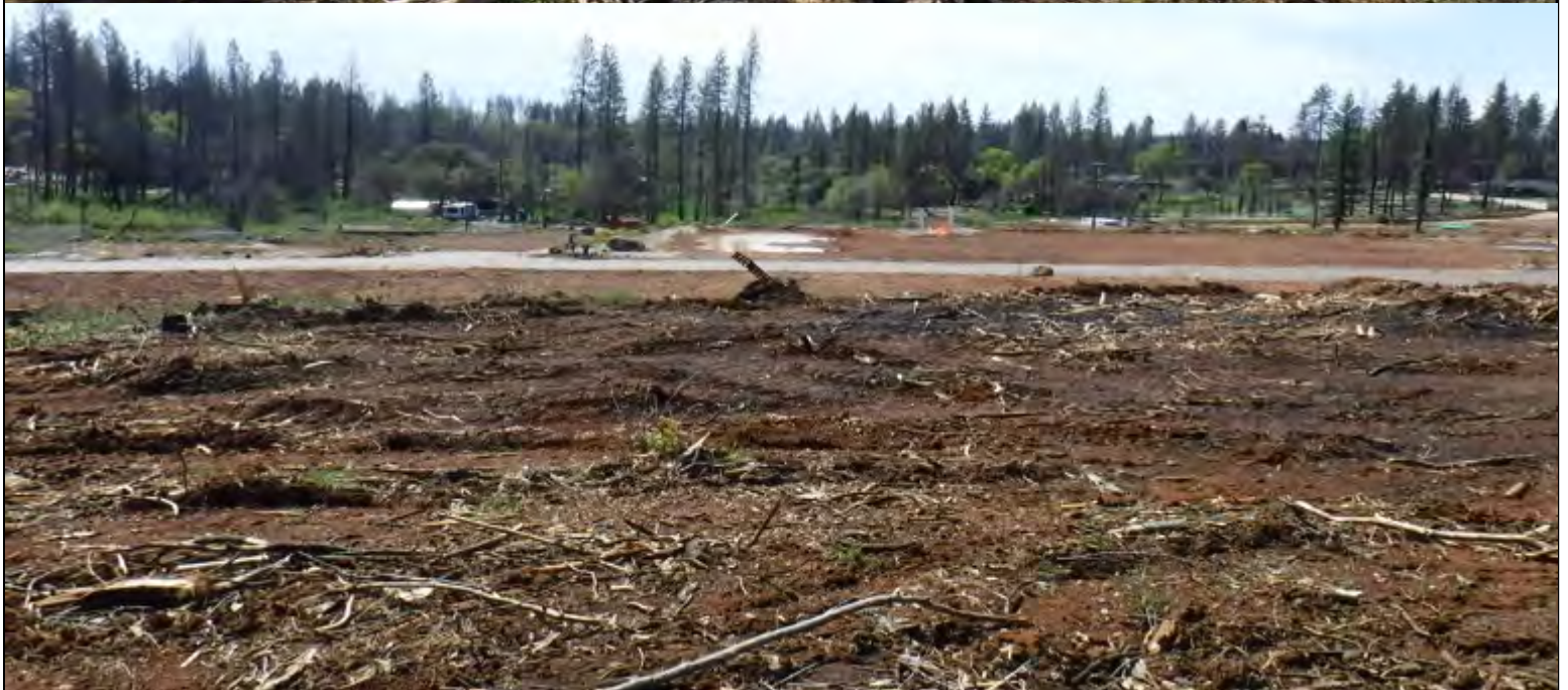
SITE PHOTOGRAPHS – APRIL 8, 2020 NOBLE PARK PROJECT EAST OF PENTZ ROAD AND SOUTH OF MERRILL ROAD, PARADISE, CA