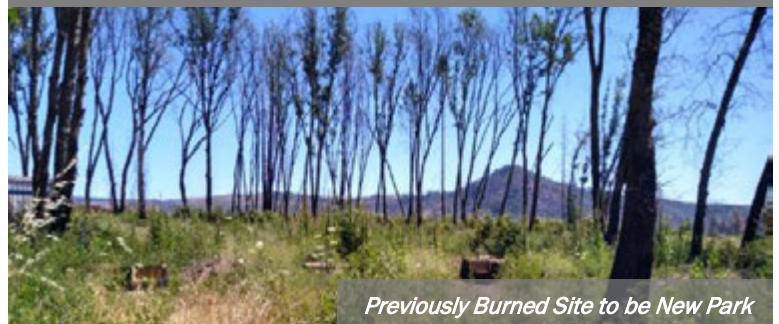
Previously Burned Site to be New Park